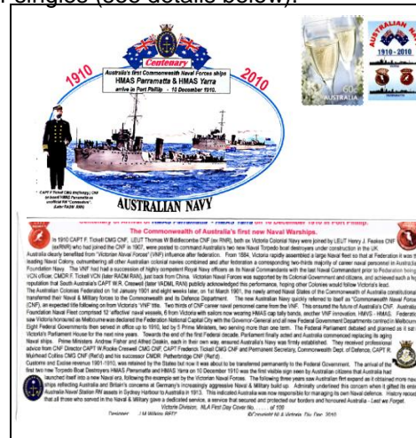
Front and Back of FIRST