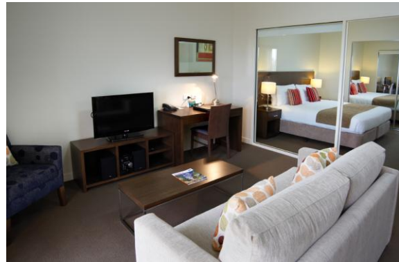
1 Bedroom Apartment Living/Bedroom