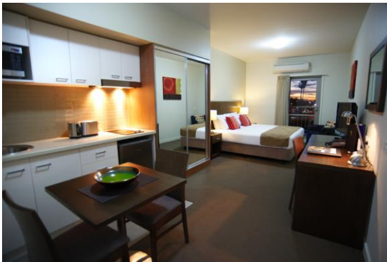
Studio Apartment including Kitchenette