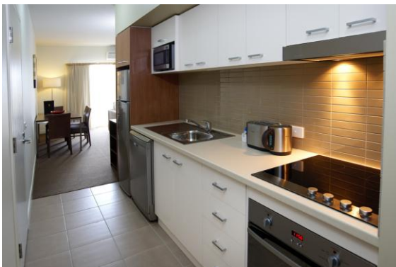
1 Bedroom Apartment Kitchen