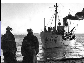
HMAS GOORANGAI coming alongside