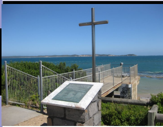
GOORANGAI Memorial at Ocean View Reserve, Queenscliff

When patrol boats had dedicated crews, they were the hardest working crews in the Navy. For instance, the Darwin based boats generally sailed away for six weeks and then spent two weeks at the Darwin Naval Base. In the early days, much of the crew's time in DNB was taken up with maintenance, until it was pointed out that those ashore in DNB were there for that purpose, thus giving the Boat's crew some relief. Today there are multiple crews for different boats, such as three crews for two patrol boats. This has proved to be a very successful approach to keeping the boats at sea, but most importantly providing some respite for the crews. This new method of utilizing the men and women in the Navy is different and whilst it must be working, the traditional connection with ship and crew must also be different. Interest in Ship/Unit Associations is waning, no doubt we need to do a little research to determine how changing platforms impacts on us!